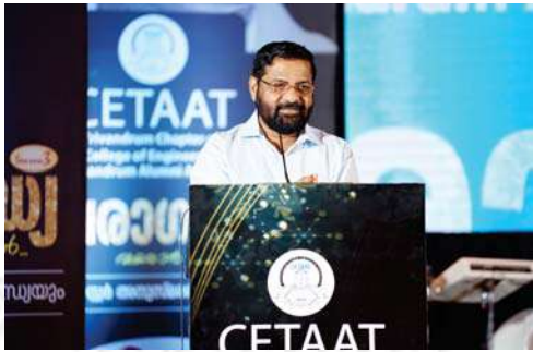
Inauguration by Hon Minister Kadakampally Surendran