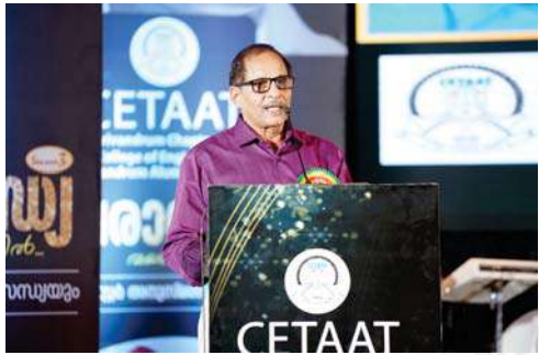
Presidential address by Chairman