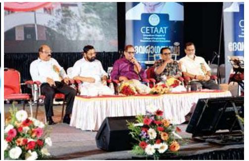
A View of the dignitaries